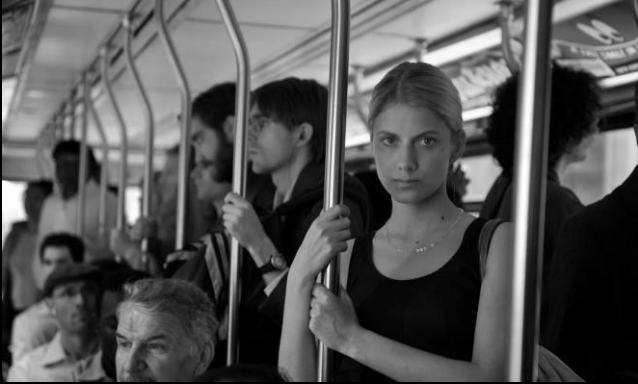
Clementine, 35 Melanie Laurent