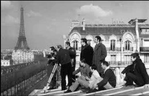
French New Wave – meets Social Action